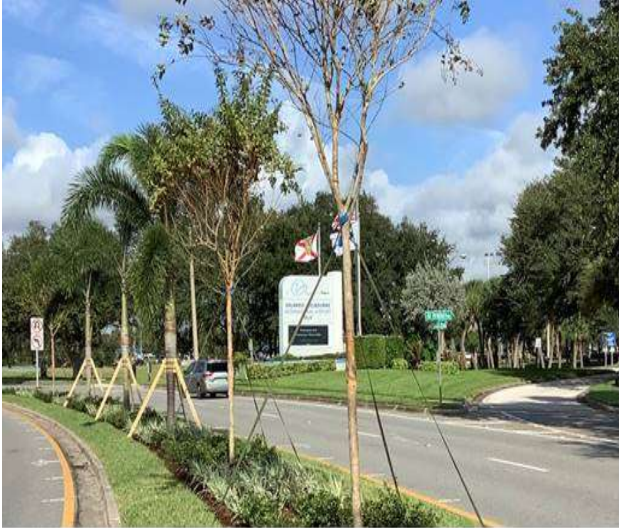
PICTURED ABOVE IS ONE OF THE MEDIANS ENHANCED BY THE NASA BOULEVARD LANDSCAPE MEDIANS PROJECT