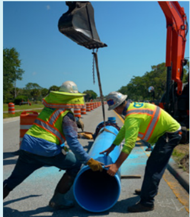
New water distribution main along NASA Boulevard, Dr. Martin Luther King Jr. Boulevard, and Apollo Boulevard