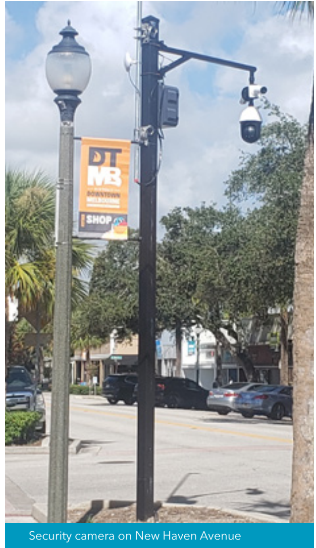
Security camera on New Haven Avenue

Near the Pineda Causeway, the Pineda Commons business center began to take shape with some of the buildings completed and some still under construction at the close of 2024. Pineda Commons will be anchored by Sprouts Farmers Market and EOS Fitness and will