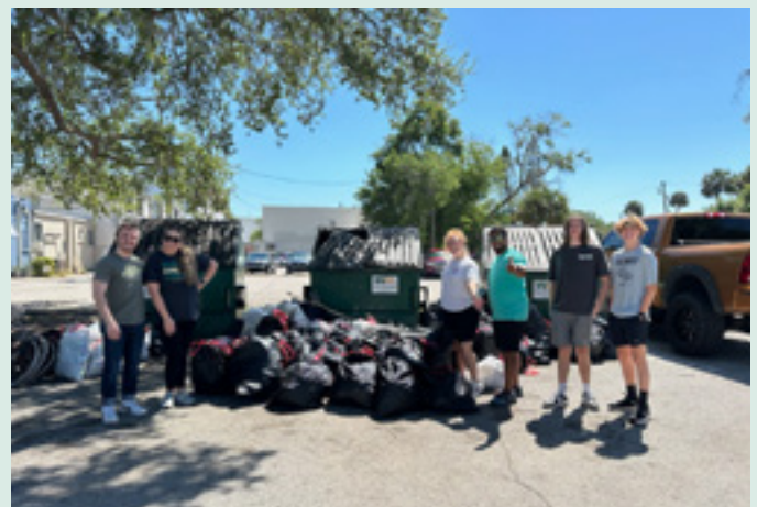
Trash Bash volunteers