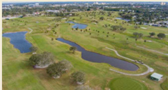
Crane Creek Reserve Golf Course