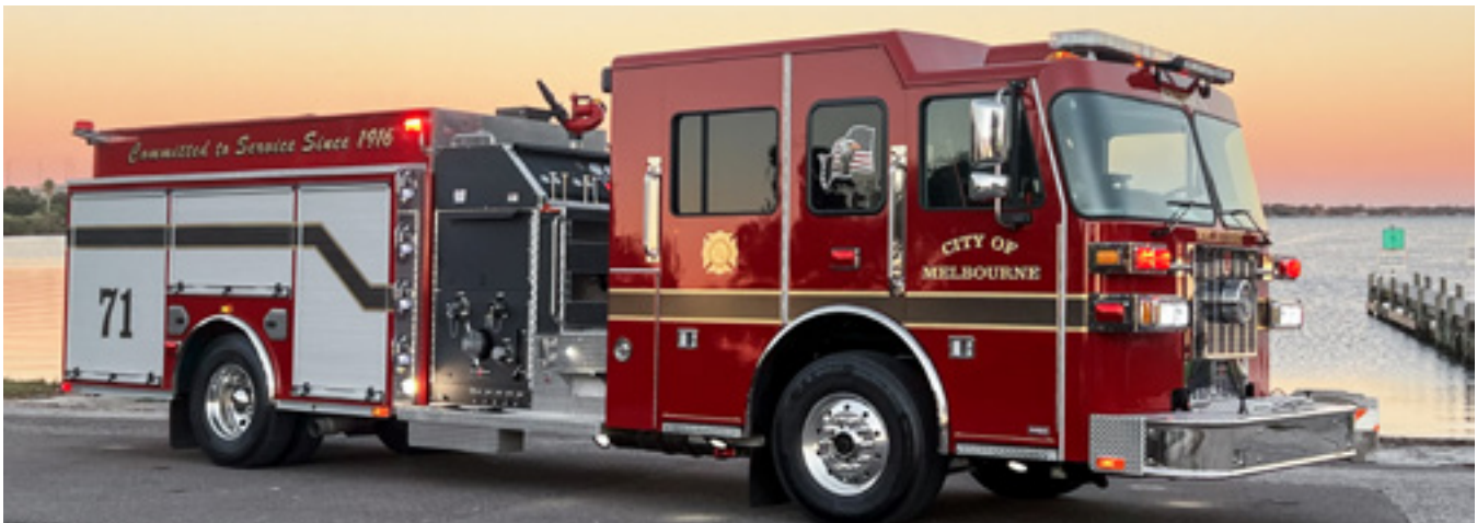
New fire engine

The Fire Department was able to add 12 new firefighters in 2024 thanks to a $3.3 million grant from FEMA's Staffing for Adequate Fire and Emergency Response (SAFER) program. In December, a new fire engine was placed into service at Station 71.