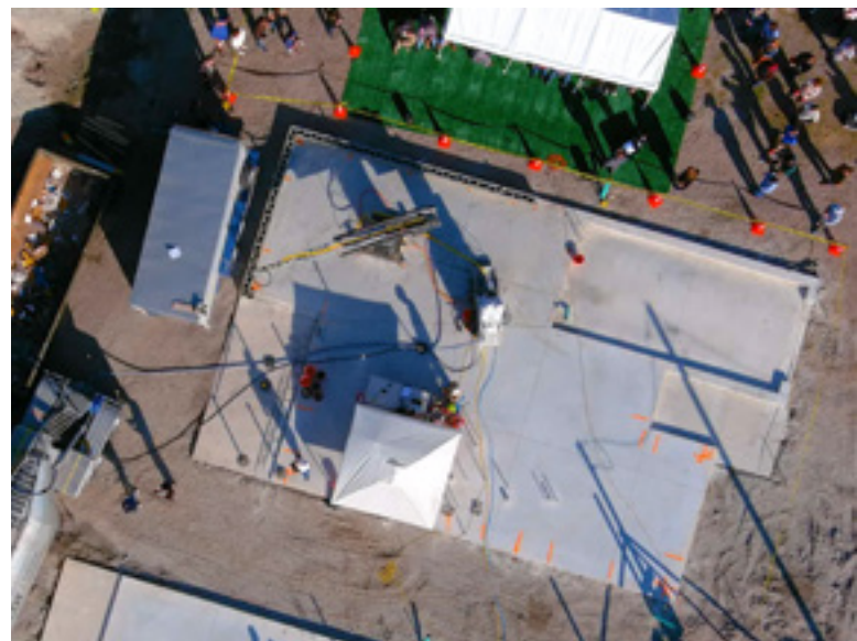
Habitat for Humanity's 3D printed home "wall raising" ceremony

Community of Hope Inc. made progress toward the completion of the construction of a single-family home on Elizabeth Street. It will be a rental property for very low to moderate-income families.