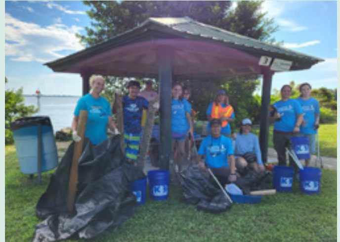
International Coastal Cleanup volunteers

In March 2024, a new baffle box was completed near NASA Boulevard and the railroad tracks, which removes pollution from a 155-acre drainage basin around NASA Boulevard for areas primarily east of Babcock Street. Baffle boxes are underground structures made up of chambers that trap debris, trash, and other pollutants from stormwater that flows off of streets and into storm drains after heavy rains. The City of Melbourne is working to construct baffle boxes at key points throughout the city to keep pollution out of the Indian River Lagoon.