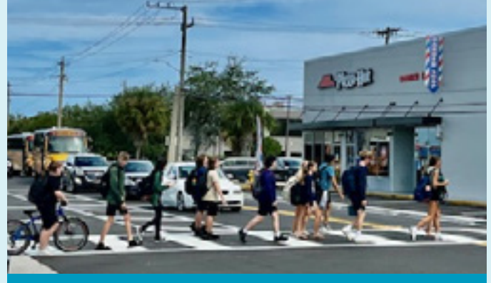
New crosswalk in front of Melbourne High School