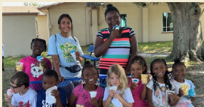
Summer camp at Eddie Lee Taylor, Sr. Community Center