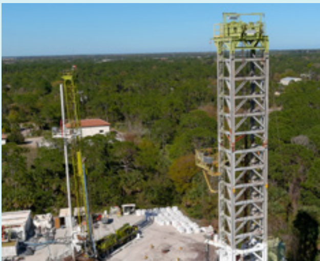
Deep injection well construction

Work to replace and upgrade the RO plant's degassifiers and scrubbers (key components necessary in the RO treatment process) has also been completed. At the surface water treatment plant, construction of a new filter drain line was completed and a project to rehabilitate the existing filter gallery began.