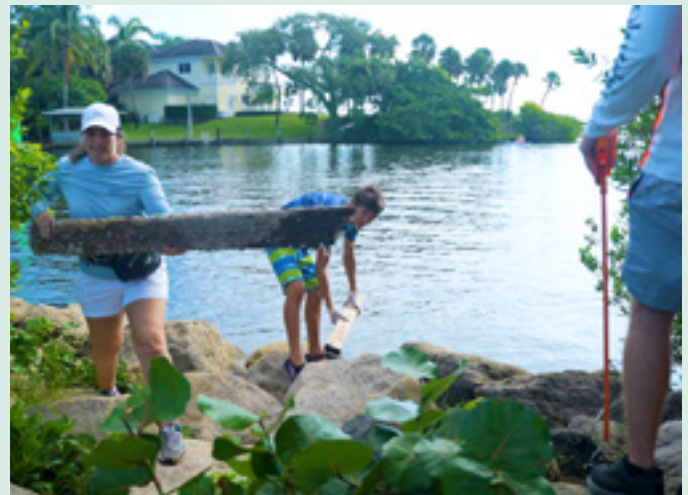
Volunteers removing trash from the Ballard Park shoreline