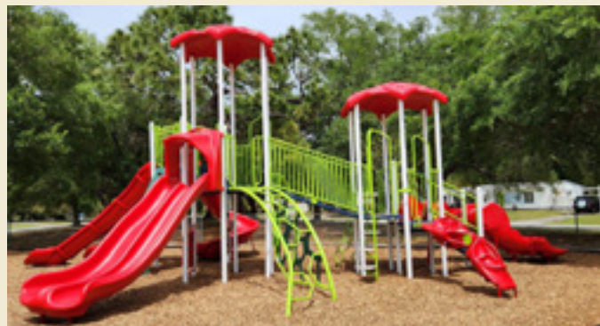
Magnolia Park's new playground

A wide variety of classes, activities and special events were held at the City's community centers and parks, including the first Jimmy Buffet Day event at Front Street Park. The Parks, Recreation and Golf Department also completed a strategic plan and master plan to guide future programming and facilities