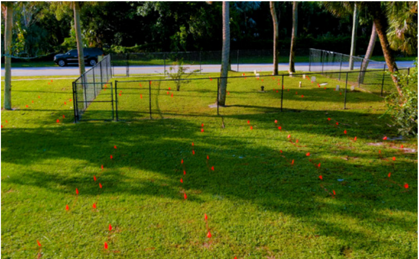
Flags mark the boundaries of grave sites found during the ground-penetrating radar survey of Line Street Cemetery.