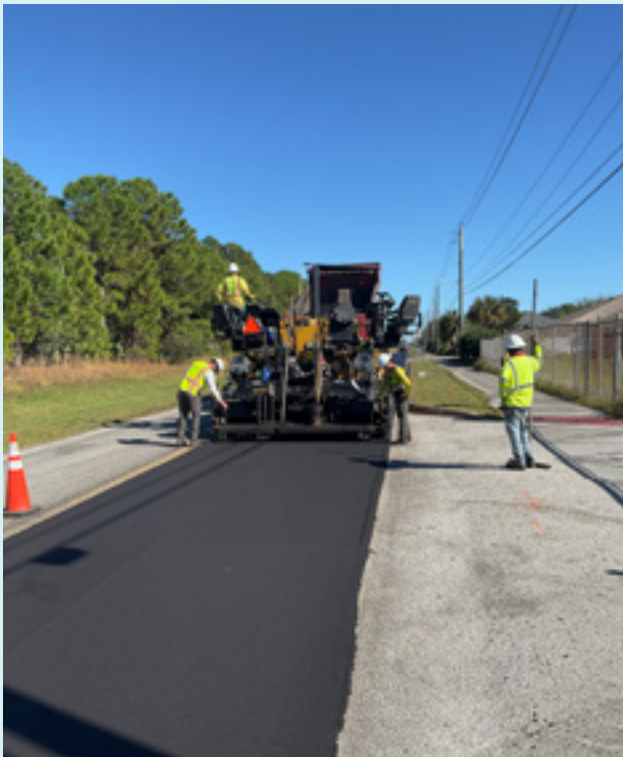
Pirate Lane repaving

A restoration project to stabilize 410 feet of Indian River Lagoon shoreline along Pineapple Avenue that was eroding away was completed using 1,335 tons of rock. This work will prevent future erosion from damaging the roadway and the foundations of FPL transmission poles.