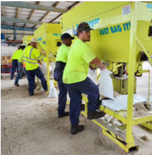
City crews filling sandbags before Hurricane Milton