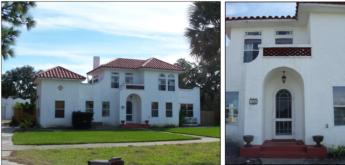
Figure 3: Main (North) Façade and Entrance

Source: City of Melbourne, January 2008.