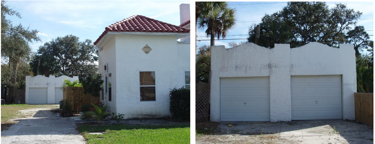
Figure 5: Garage and Driveway