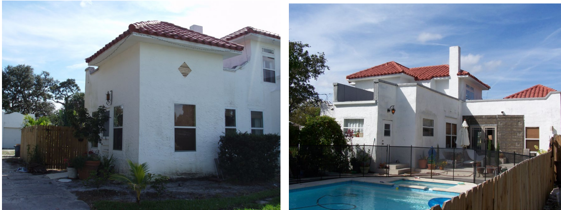
Figure 7: Northeast and South Sides of the Building