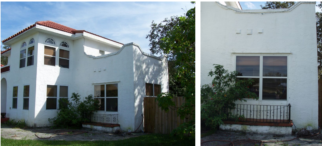
Figure 6: Northwest Side View