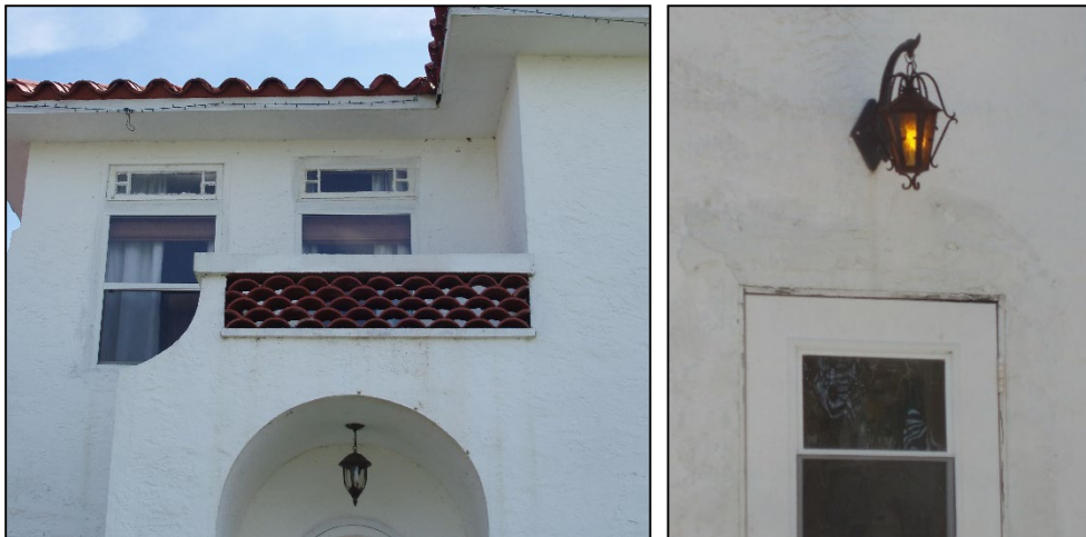
Figure 4: Decorative Features