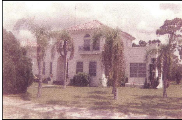
Figure 8: Property in 1969